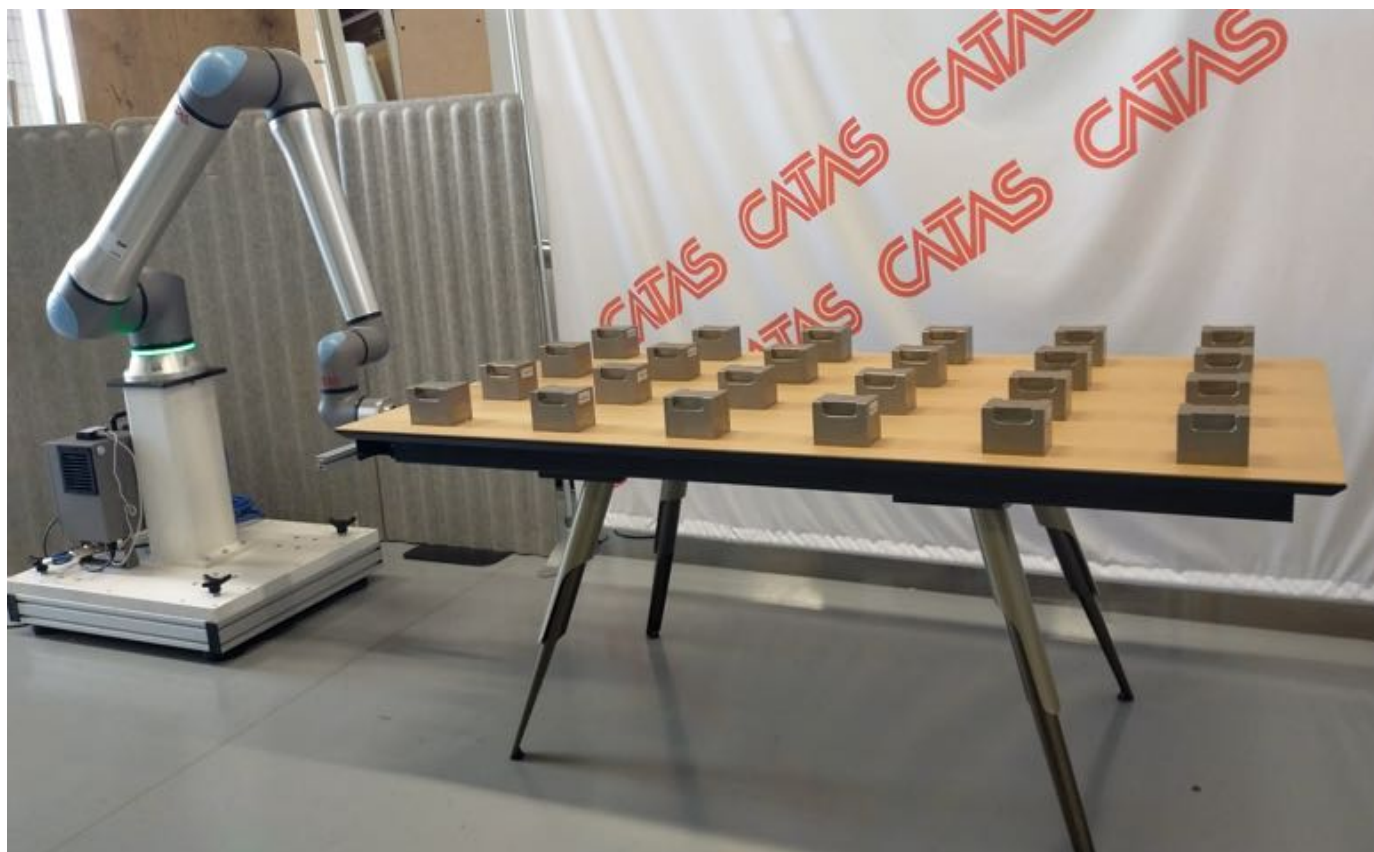
Picture of the table undertest.