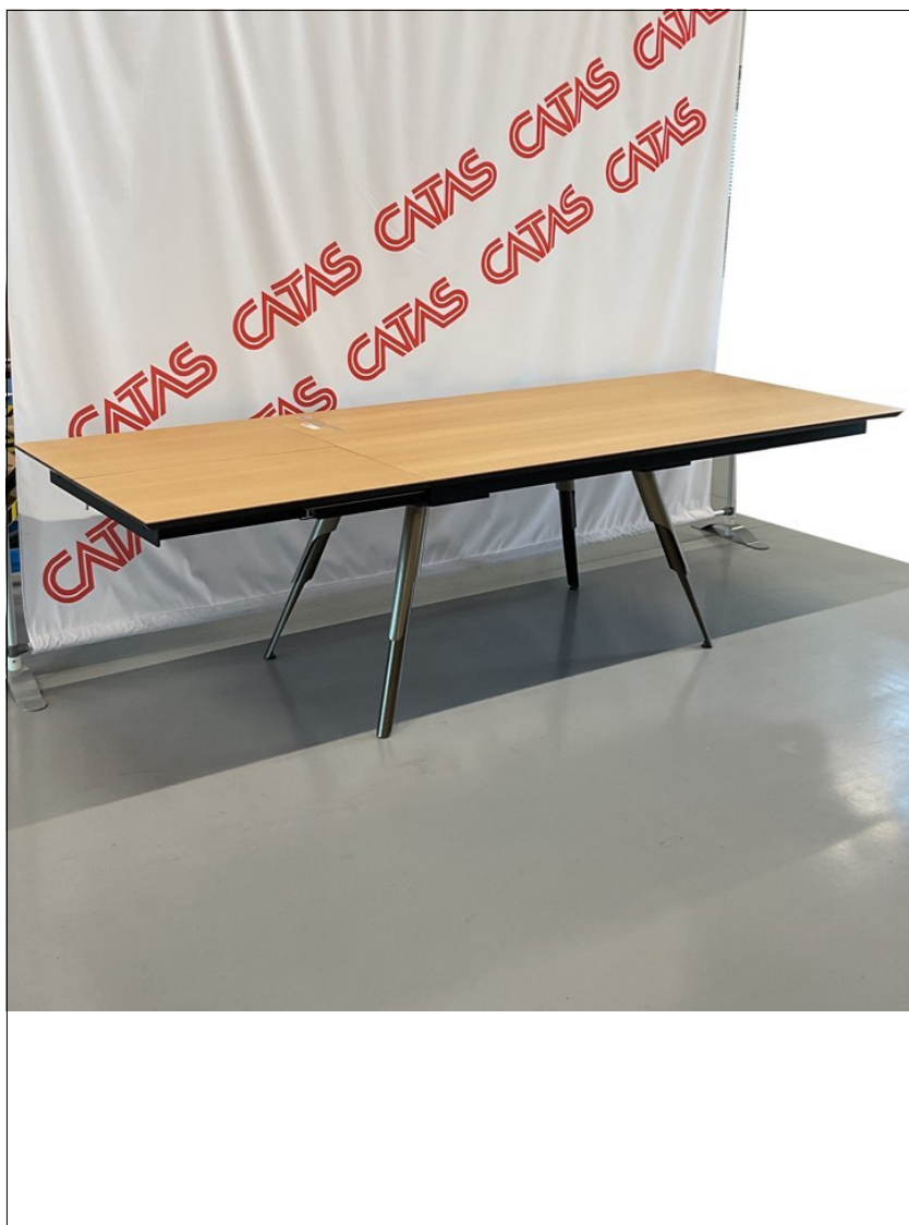
Table in extended configuration

Date of issue: 11/07/24 Sample weight: Not determined Overall dimensions: 2800 x 1000 x 780 (h) mm Sample name: IN00 - 00000090 - SYNCHRO